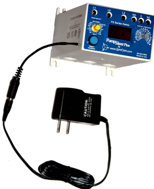
Figure 1: AC to DC Power Converter Setup for 777-KW/HP-P2-DEMO

To connect a demonstration accessory, reference the instructions at the end of this document. Refer to Figure 2 for connections.